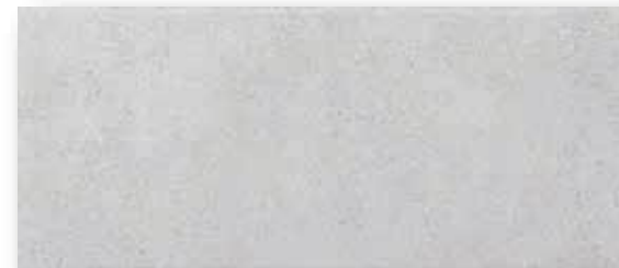
Hall's bathroom pavement