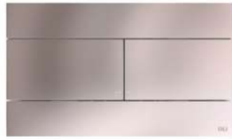
TOILET + PUSH BOTTON

Bathroom fittings in recessed wall shower, with rain system in master bedroom bathroom, and placed in wall in secondary bathroom.