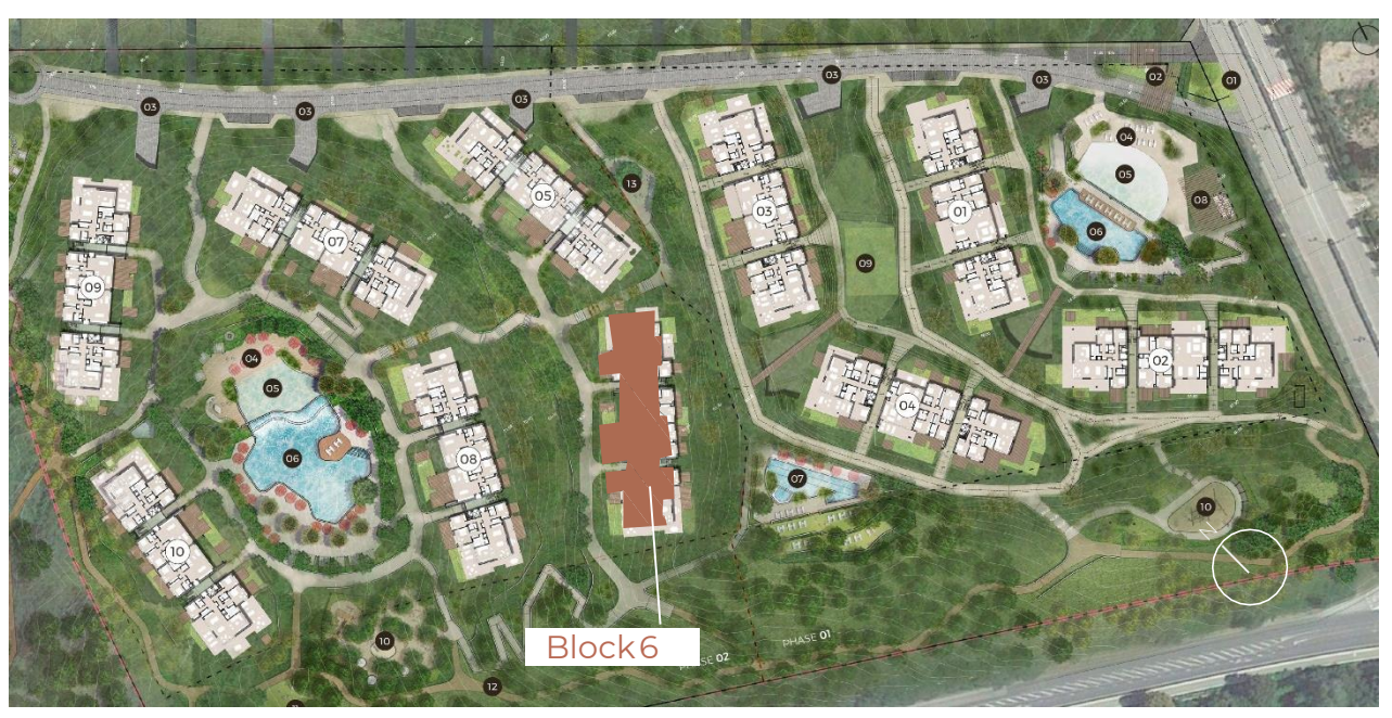
3 | 7